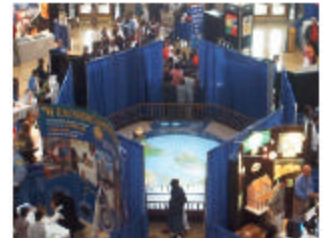
Virginia Energy Fair October 2003

Increasing public awareness of energy efficiency and renewable energy is done largely through outreach. OPP was an active participant in events such as Richmond's Clean Commute Day, the Association of Energy Conservation Professionals 4 th Annual Energy Exposition, and the Virginia Energy Fair held at the Science Museum of Virginia.