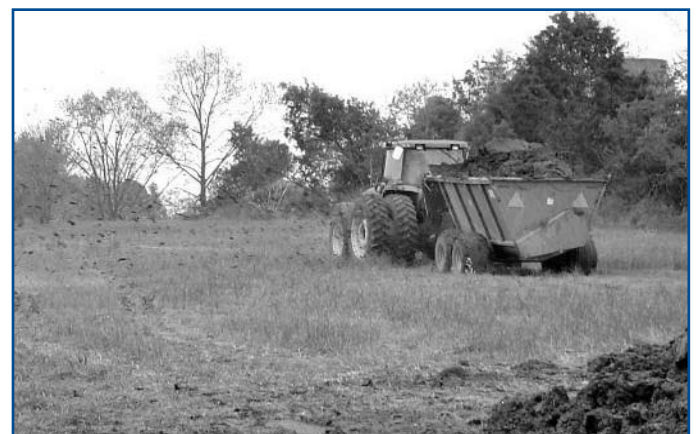
Biosolids are applied to a field in Spotsylvania County.