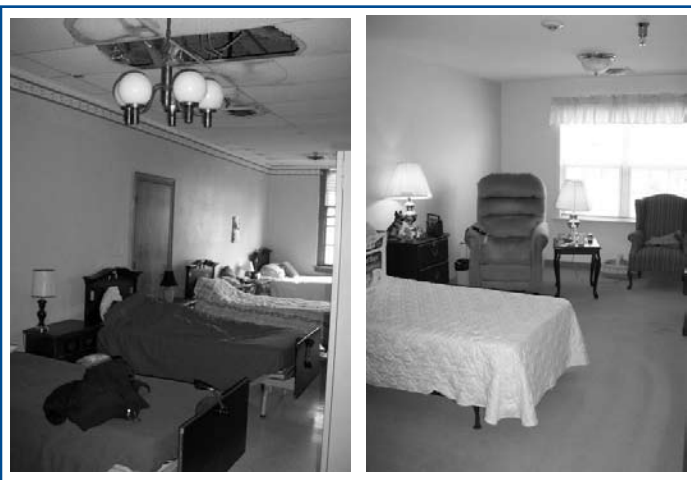
A four-person room and private bedroom at two facilities illustrate the range of accommodations in Virginia's assisted living facilities.