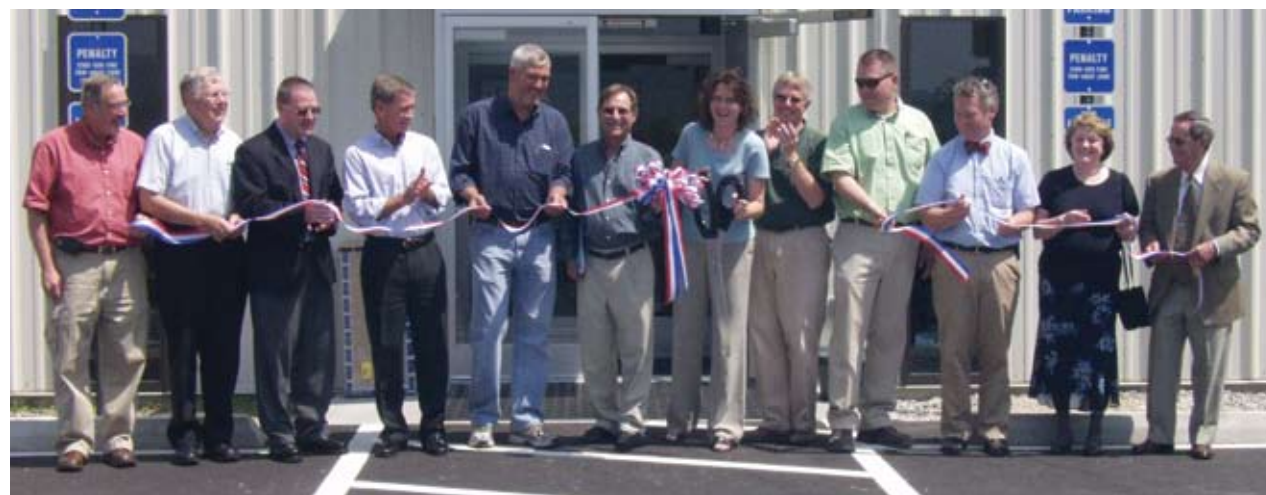
Maxxim Shared Services, a subsidiary of Alpha Natural Resources, cuts the ribbon on its new office space in the Wise County shell building, which is now fully occupied. The new space consolidates engineering and related functions of Alpha mining operations in Southwest Virginia and Eastern Kentucky. This former shell building also houses Crutchfield Corporation and Carroll Engineering.