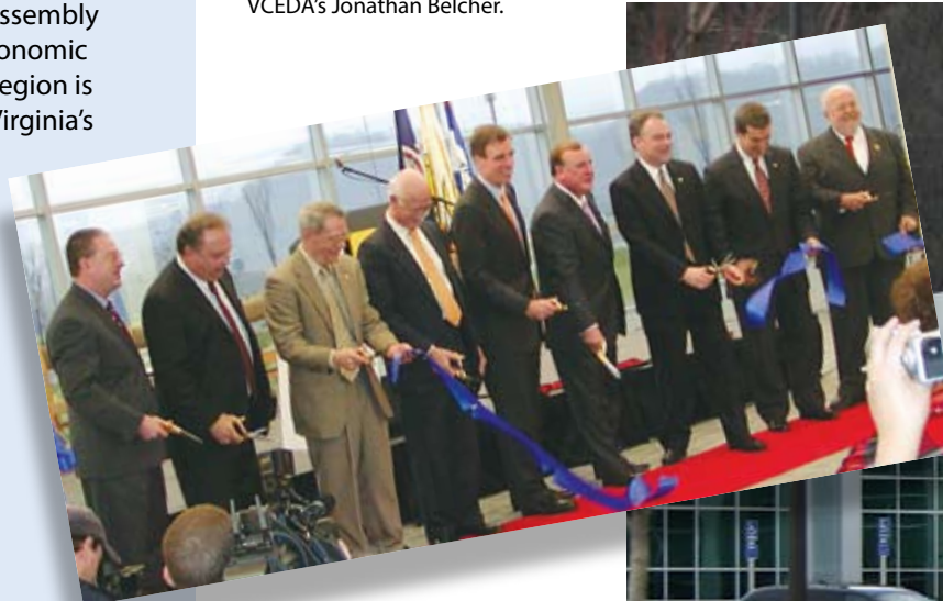
Ribbon-cutting ceremony for the new Northrop Grumman center takes place inside the $34.9 million facility in the Russell Regional Business Technology Park in Lebanon.