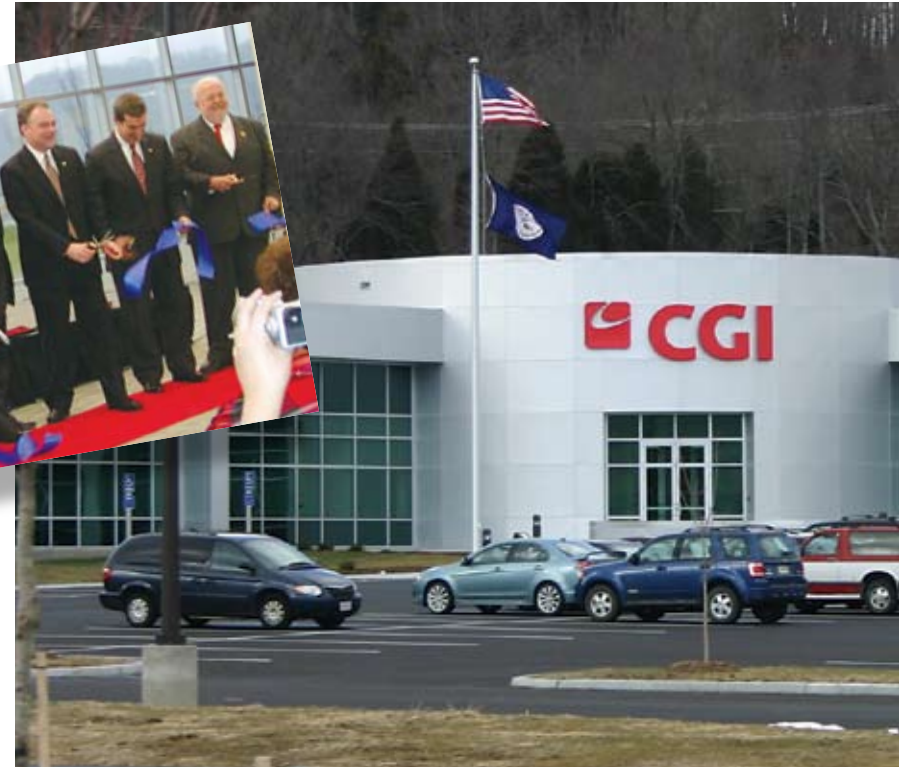
CGI's Southwest Virginia Center of Excellence