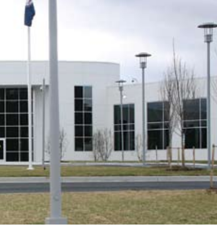
Northrop Grumman's Southwest Enterprise Solutions Center

Governor Tim Kaine tells the audience it is great to be a part of both the groundbreaking and the opening ceremonies for the technology centers in adjacent locations in the Russell Regional Business Technology Park.