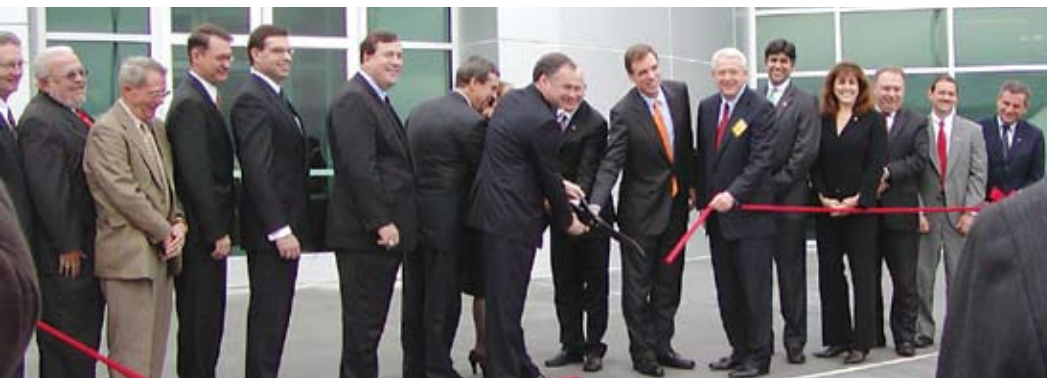
Governor Tim Kaine and former Governor Mark Warner join in the ceremony for CGI's new Southwest Virginia Center of Excellence.