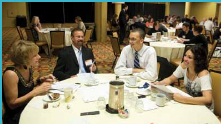
Student leaders and school officials worked to develop action plans during the Education Leadership Colloquium on the Civic Mission of American Education.