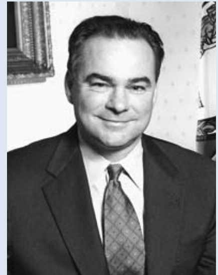
Governor Timothy M. Kaine