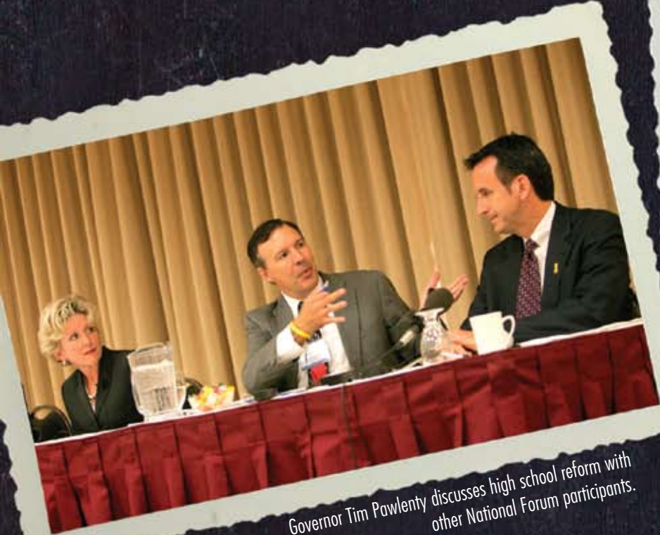
Governor Tim Pawlenty discusses high school reform with other National Forum participants.