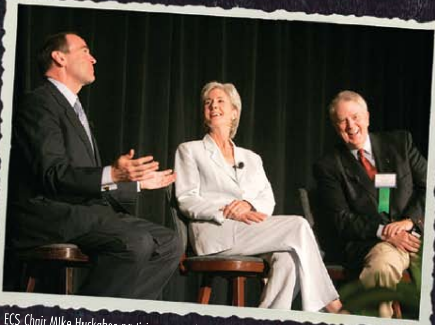
ECS Chair Mike Huckabee participates in a lively discussion on education challenges with Governor Sebelius and former Governor Hunt.