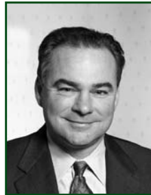
Hon. Tim Kaine Governor Commonwealth of Virginia