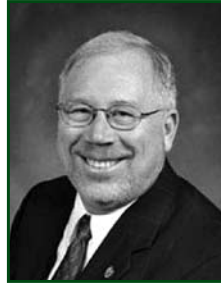
Hon. Luther Olsen Chairman Senate Education Committee Wisconsin State Senate