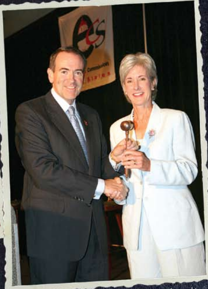
2004-06 ECS Chair Mike Huckabee passes the gavel to Kathleen Sebelius, the 2006-08 ECS Chair.