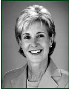
Hon. Kathleen Sebelius Governor Kansas