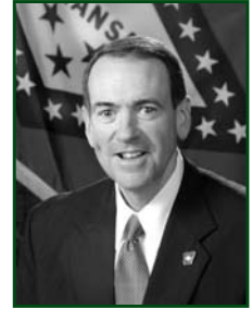
Hon. Mike Huckabee Governor Arkansas