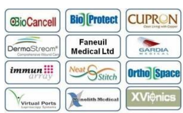
with 12 Israeli companies and has made direct investments in 9 Israeli companies.

A special relationship has been developed with the BIRD Foundation (Binational Industrial R&D Foundation). The BIRD Foundation provides up to $1 million for a joint R&D project undertaken between and Israeli and a US company. For the first time in thirty years, the VIAB has succeeded to demonstrate to BIRD management that the VISBCC can serve as the primary recipient of funding which has usually been reserved for companies only. This new paradigm will allow flexibility and easier access to capital that is needed to establish the Israeli companies in Virginia.