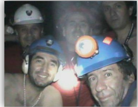
Cupron socks were sent to the Chilean minors trapped for 69 days. A physician report stated that the copper oxide impregnated in the socks prevented foot fungus in the prolonged moist environment.