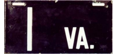
Virginia's First License Plate (1906)

On June 1, 1906, the state's first vehicle registration and license plate was issued for a fee of $2.00. The license plates were black and white in color and made of porcelain and measured 5 inches by 11 inches. These first passenger license plates were issued as straight numbers 1 through 99. As registration increased, the A series was implemented, A 1 through A 999-999. In 1970, a B series was added. However, the letter B was often misread as an eight and it was discontinued.