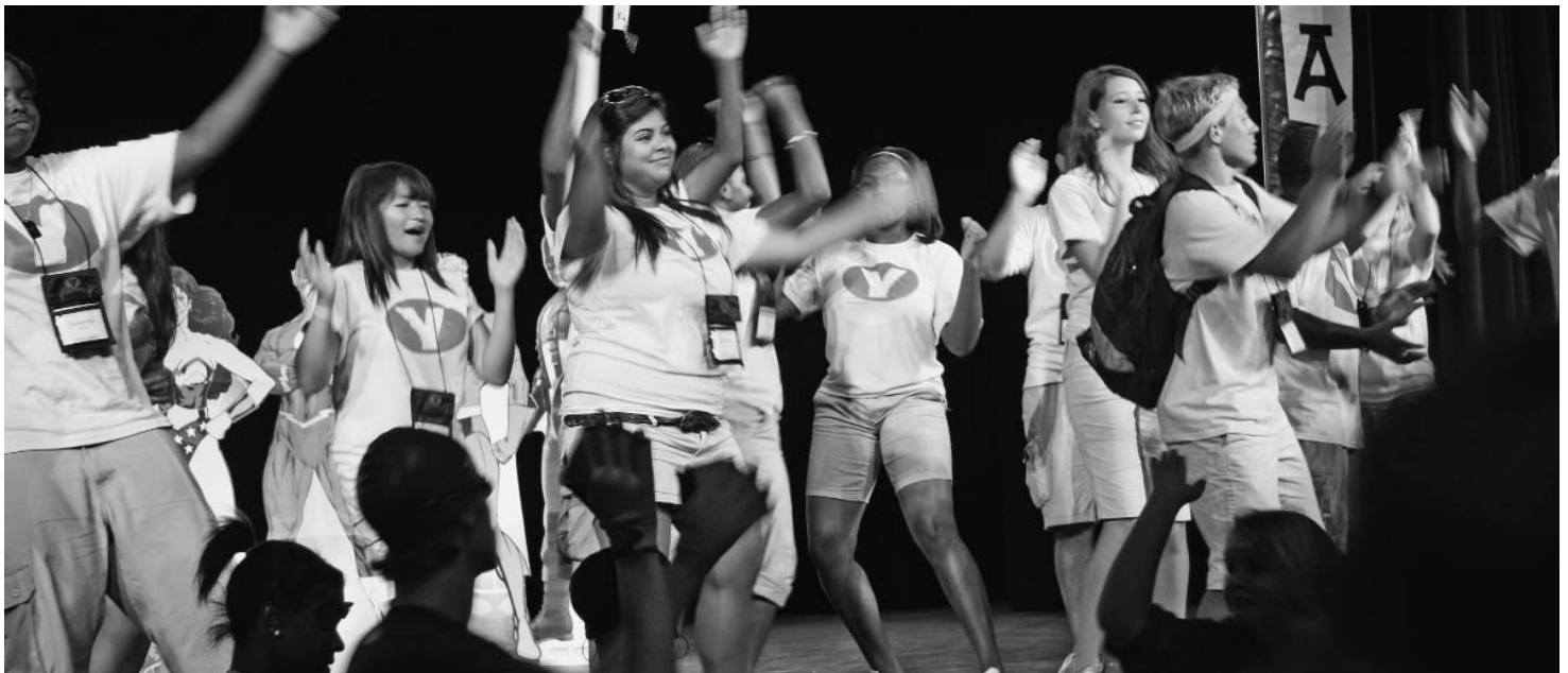
(Above) Youth Alcohol & Drug Abuse Prevention Project (YADAPP) youth leaders take the stage and energize more than 400 conference participants during the opening session of YADAPP 2011: “The Adventures of Y-Guy!” The 27th annual summer conference was held at Longwood University in Farmville, Va., July 18–21.