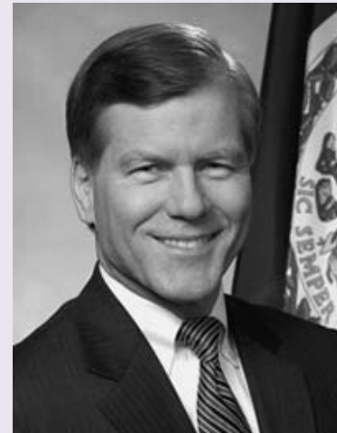
Governor Robert F. McDonnell