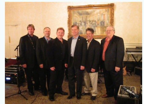
Governor Bob McDonnell poses for a photo with the Norfolk Southern Lawmen, who provided the musical entertainment for a dinner event during the Red Carpet Tour of Virginia's e-Region.