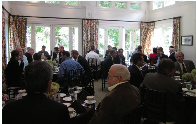
Red Carpet Tour guests enjoy lunch with Governor McDonnell, Lt. Gov. Bolling, and the region's economic development allies at the Chancellor's residence at the University of Virginia's College at Wise. At this luncheon, the participants heard presentations from the economic development allies on available sites and buildings and other assets and advantages of the region. The tour participants also heard a regional presentation from VCEDA at a working breakfast held with the Governor that morning.