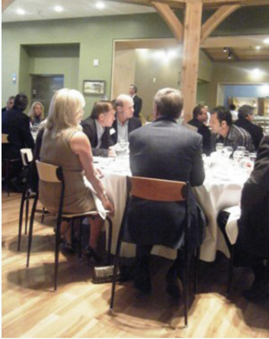
Governor Bob McDonnell participates in a discussion with a business executive during the Red Carpet Tour of Virginia's e-Region in September. The tour, hosted by Governor McDonnell, brought the largest single group of business executives and site consultant prospects to the region in many years, and VCEDA is continuing to work with contacts from the tour. Thirteen business executives and site consultants attended the event; two additional prospect visits as a result of the tour took place afterwards.