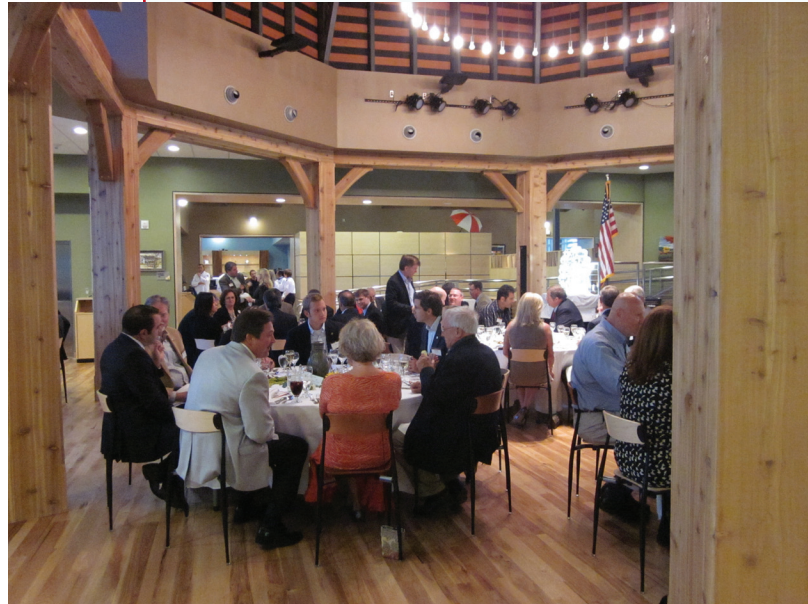
Governor Bob McDonnell visits with invited business guests at the kick-off dinner for the Red Carpet Tour.