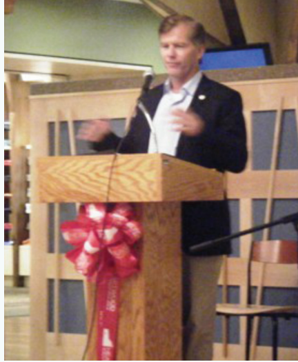
The highlight of the year was Governor Bob McDonnell's economic development Red Carpet Tour of the region. In the photo, Governor McDonnell welcomes business executives and site consultants during this tour which was held Sept. 18-20. At the Governor's invitation, over a dozen business executives and site location consultants visited the region to tour business and technology parks, existing businesses and educational assets such as the University of Virginia's College at Wise. Lieutenant Governor Bill Bolling, other members of the Governor's staff, the Virginia Economic Development Partnership, VCEDA, and local economic developers and legislators from the region assisted with the tour to showcase the region's attributes.