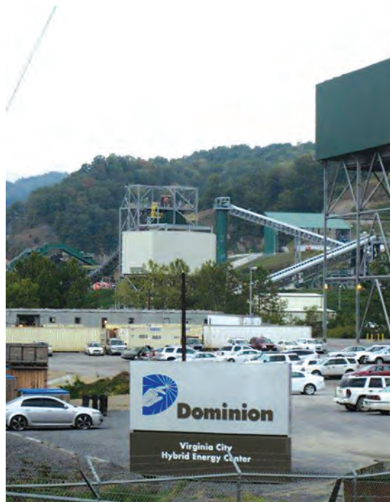
Dominion Virginia Power placed the Virginia City Hybrid Energy Center in Southwest Virginia into commercial operation in July and holds a dedication ceremony and ribbon-cutting on September 27 for the new facility with Governor Bob McDonnell and numerous other special guests attending. The $1.8-billion circulating fluidized bed (CFB) project uses coal, waste coal and biomass to generate 585 megawatts. The project employed over 2,300 construction workers at its peak, and will have an 84 person permanent operations team.