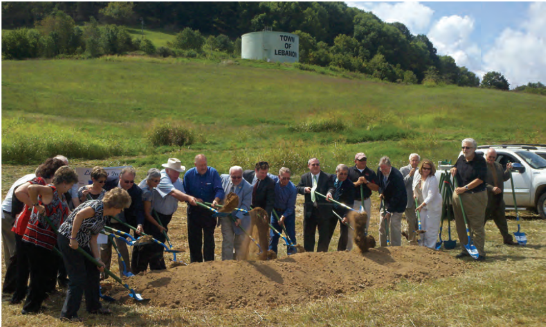
The Russell County IDA holds a groundbreaking ceremony Aug. 31 for a new 56-room Holiday Inn Express to be built in the Cumberland Plateau Regional Industrial Park in Lebanon. The project is being funded by up to a $2.8 million loan from VCEDA, up to a $1 million loan from the Virginia Small Business Financing Authority, up to a $250,000 loan from Cumberland Plateau Planning District Commission, in addition to funding from the developer. The hotel will be owned by the Russell County IDA and lease-purchased to Lebanon Inn, LLC. The project is expected to create 100 construction jobs in addition to the jobs the hotel will create.