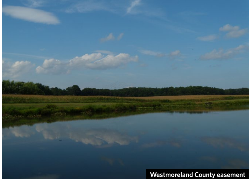
Westmoreland County easement

What we have achieved together since 1966 is an amazing accomplishment—arguably the most successful voluntary land conservation program in the nation. However, our work is not finished. We look forward to the opportunities that lie ahead.