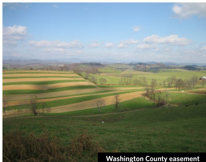
Washington County easement

On the cover: 875-acre conservation easement on the Mattaponi River in King William County, recorded in November 2013.