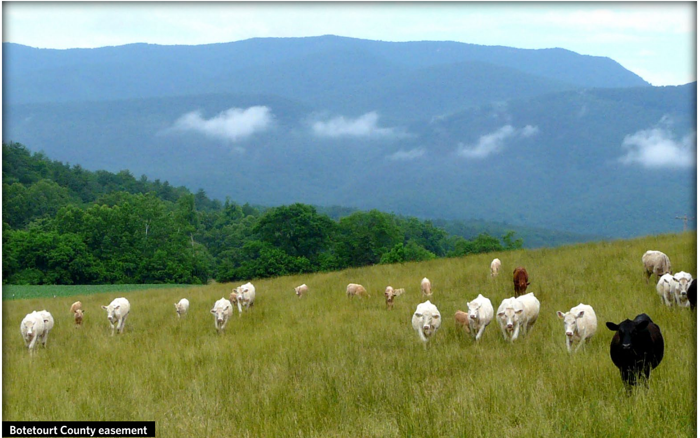
Botetourt County easement