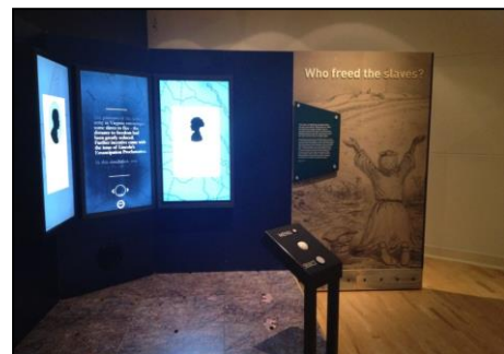
Journey to Freedom interactive exhibit

The Virginia Historical Society has conducted 41 programs and spoken to more than 1,100 students about An American Turning Point: The Civil War in Virginia through VHS's online video conferencing initiative, HistoryConnects. Students watch a five-minute introductory video ( Why War? ), independently explore the virtual An American Turning Point exhibition online, and then classes Skype with a curator for a 30-minute Q&A session.