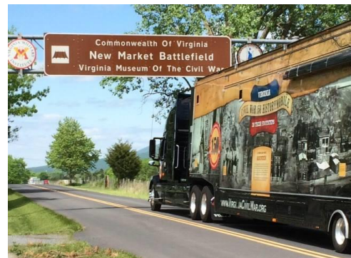
The HistoryMobile enters New Market Battlefield for the 150th anniversary of the Battle of New Market in May 2014.