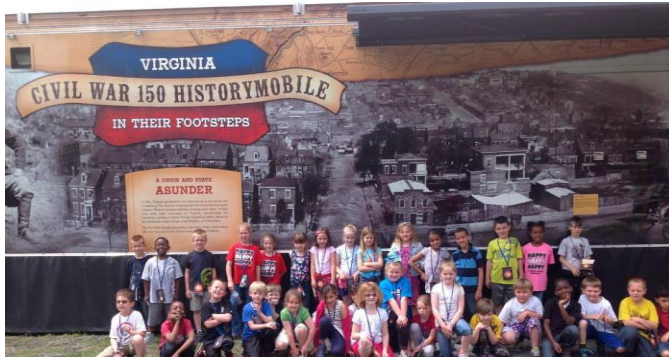
The HistoryMobile is particularly popular with students, who comprise nearly 40% of visitors.

Historical Society, Virginia Tourism Corporation, Department of Motor Vehicles, and the National Park Service.