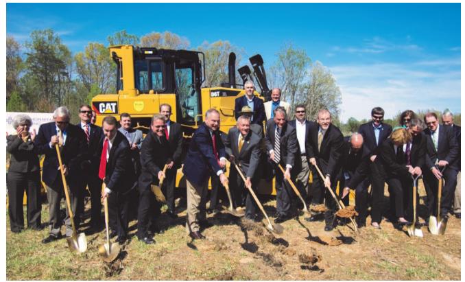
In June 2014, the Clean Energy Research and Development Center opened its doors in Washington County. The Center was planned and built with more than $9 million in Special Projects and Research and Development grants to serve as a magnet for commercializing energy research projects.