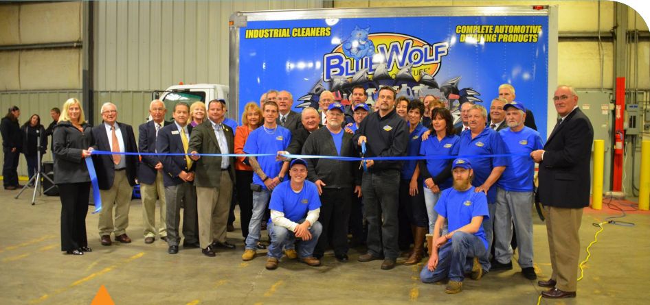
A ceremony was held on Oct. 27 in Bluefield, VA to cut the ribbon on the facility for Blue Wolf Sales and Service, a manufacturer and supplier of industrial strength cleaners. On Oct. 15, Governor Terry McAuliffe announced that Blue Wolf will expand in Tazewell County, adding 15 new jobs and investing $1.56 million.