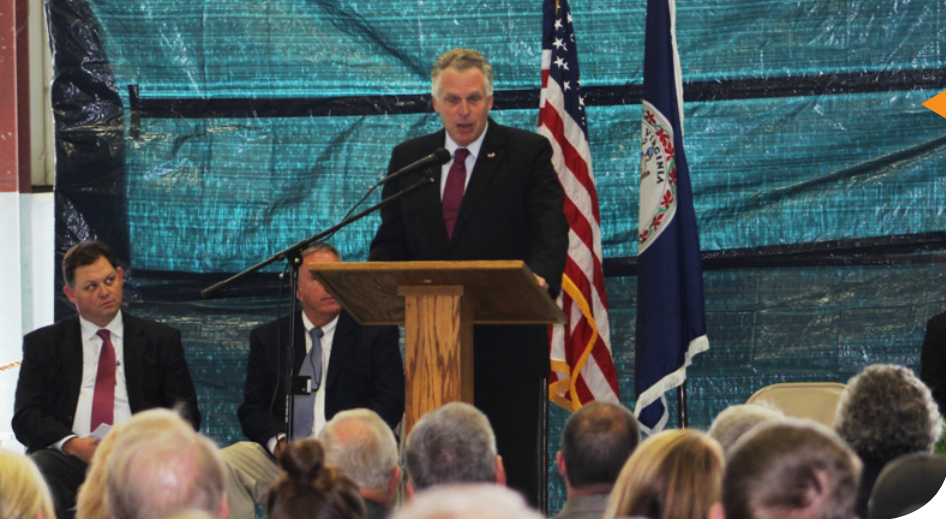
Governor Terry McAuliffe announces on Aug. 7 at Pemco Corporation in Bluefield the Go Global with Coal and Energy Technology (GGCET) program to assist coal and energy technology companies in the VCEDA region in expanding their international business. A collaboration with the Governor's Office, VCEDA and the Virginia Economic Development Partnership (VEDP), the program has six VCEDA region companies participating in the initial class.