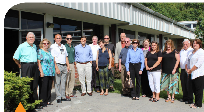
VCEDA hosts the Virginia Economic Development Partnership Aug. 17-19 on a tour of the e-Region's seven counties and the City of Norton. The group visits communities, sites and buildings throughout the region.