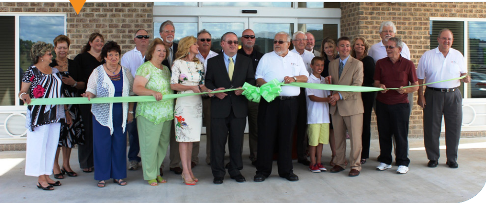
VCEDA joins Russell County officials and others in cutting the ribbon on May 27 for the official opening of the Holiday Inn Express & Suites hotel in Lebanon. VCEDA approved $3.3 million to the Russell County IDA in loan financing to help develop the hotel, which is leased to Lebanon Inn, LLC and managed by Newport Hospitality Group.