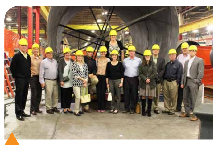
A large group from the Virginia Economic Development Partnership (VEDP) visits SteelFab in Lebanon during a familiarization tour of the VCEDA region in early November. VCEDA hosts the tour of all eight VCEDA localities so the economic development professionals can become more familiar with the region.

There were 47 prospect visits in 2016, averaging nearly one a week.