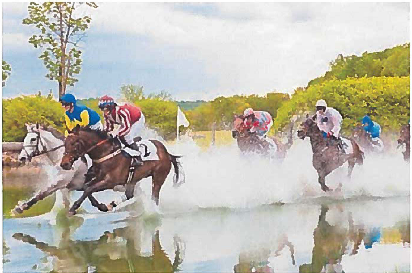
Horses competing in the Steeplethon Stakes at Great Meadow Race Course – The Plains, VA