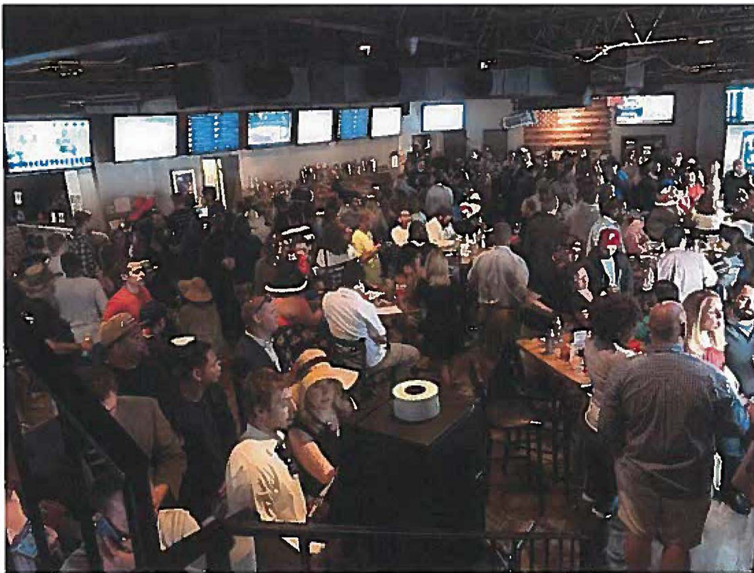
Kentucky Derby Party at Ponies & Pints Satellite Wagering Facility – Shockoe Bottom, VA