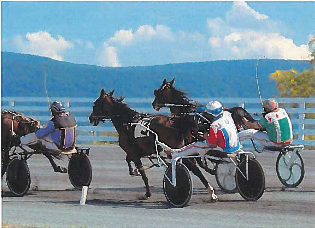
Harness Racing at Shenandoah Downs – Woodstock, VA