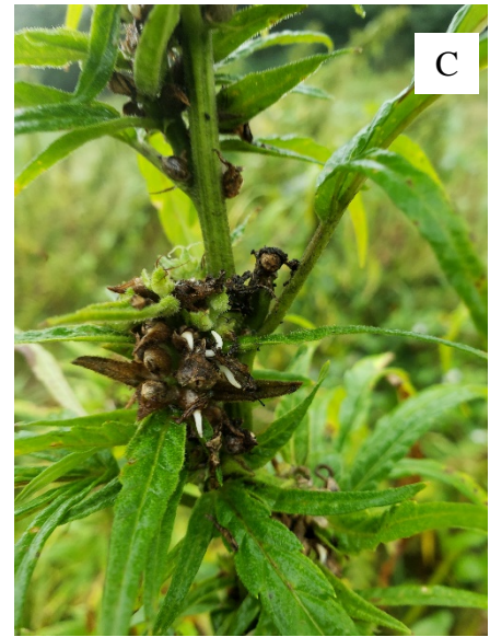
Figure 4. Field site in Augusta county. A. Strong growth for all seeding rates. B. Flooding of the site after storms. C. Seeds germinating on seed head after rain.

Due to the extreme weather this summer (too much rain too frequently), a number of sites failed because hemp was not able to compete with weeds in the wet conditions. The Loudon County site was a hay field, and the grower waited until after hay harvest to plant in early August without a burndown herbicide. The hemp did not grow quickly enough to outcompete the grasses. Similarly, Rockingham County Site B was planted no-till without burndown herbicide. Early on it was evident that the 30 lbs/acre plot was not competing with weeds as well as the 45 lbs/acre plot, but by harvest hemp was overtopped by grasses and weeds in most parts of the field. In Louisa county, herbicide was applied two times, two weeks apart before planting, which provided a window for the hemp to emerge. However, by the end of the season the hemp was overtopped by a lush crop of millet, which had been planted four years before and not seen in the field again until this year. No herbicide was used at the Stafford County site, and the three plots were disked then planted via hand broadcasting. Although there was strong emergence, most of the hemp was overtopped by weeds by mid-July.