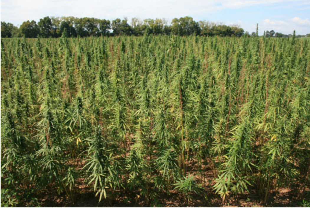
Fig. 2. Late (mid-July) field planting of industrial hemp in late August.