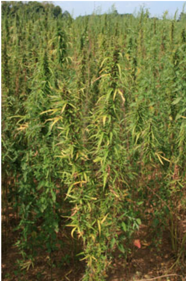
Fig. 1. Early (mid-June) field planting with mature stand of industrial hemp in late August.

To date, our preliminary data support the importance of proper field preparation and adherence to the basic principles of agricultural production. Individuals that think any field or site can be converted to hemp production are likely to be disappointed. Best yields can be expected from fields that have been in agricultural use and are properly prepared for planting. Fields with extensive seed banks from prior years will not produce quality crops of hemp. Hemp is susceptible to drought which can put it at a competitive disadvantage with weeds. Early moisture is extremely important to get prompt germination and seedling establishment. On the other hand, too much water is deleterious to hemp production. Hemp performs best in well-drained soils. There is still a need to determine the best cultivars for Virginia and an even greater need to develop the markets for raw inputs of industrial hemp.