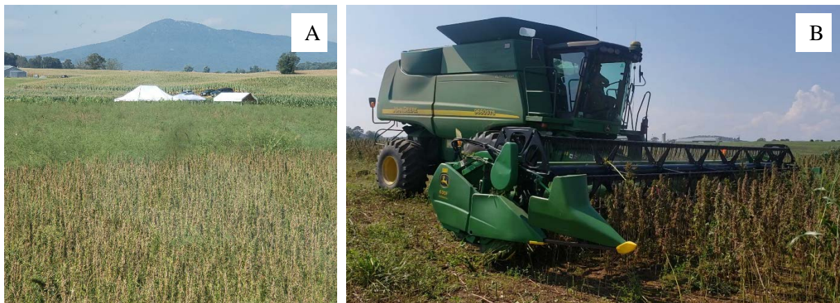
Figure 5. Rockingham County Site A on September 21, 2018. A. The large plots from above. Note the dramatic difference between the foreground (mostly brown hemp seed heads) showing the early July planting with few weeds and the background in front of the tent; the brighter green of the weeds shows severe weed pressure in the mid-June planting. B. Hemp harvest with conventional equipment.

Rockingham County Site A had six large plots. CFX-1, CRS-1, and Joey cultivars were planted in ~1.5 acre plots in mid-June and again in early July. The field was ripped after barley harvest, then tilled and rolled before planting. No herbicide was applied. The mid-June plots grew well; however, there was high weed pressure (Figure 5A), especially from lambsquarters ( Chenopodium album ), spiny pigweed ( Amaranthus spinosus ), and redroot pigweed ( Amaranthus retroflexus ). The amount of weeds meant that the fiber would be unlikely to be useful, and seeds would need to be cleaned well to remove weed seeds. The early July plots also grew well, catching up to the mid-June plots by harvest time. However, there was very little weed pressure on the July planting; although there were some patches of the weeds, most of the ground was bare under the hemp. Although population densities of pest caterpillars did eventually increase, this was after seed development and generally after seeds should have been harvested. We put off harvest for a week so we could harvest at the JMU Industrial Hemp Field Day (Figure 5B), but unfortunately rainstorms pummeled our plots in the interim. As with the Augusta site, the seeds that were left on the plants germinated on the seed head.