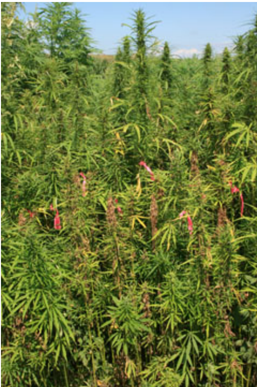
Fig. 3. Small plot trial ready for sampling in late August.