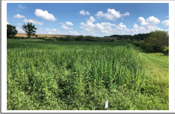
Figure 4. In Augusta County, there was a good crop with relatively low grass weed population compared to other collaborating farms.