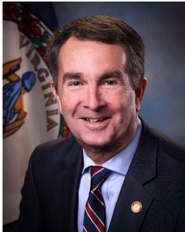
Governor Ralph S. Northam