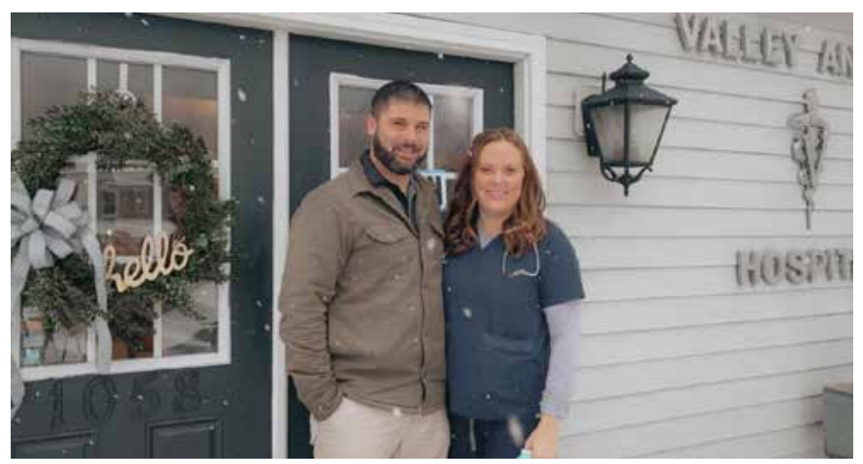
Valley Animal Clinic, PLLC