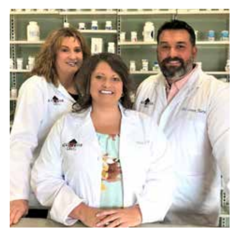
Next Door Drug Pharmacy, PC