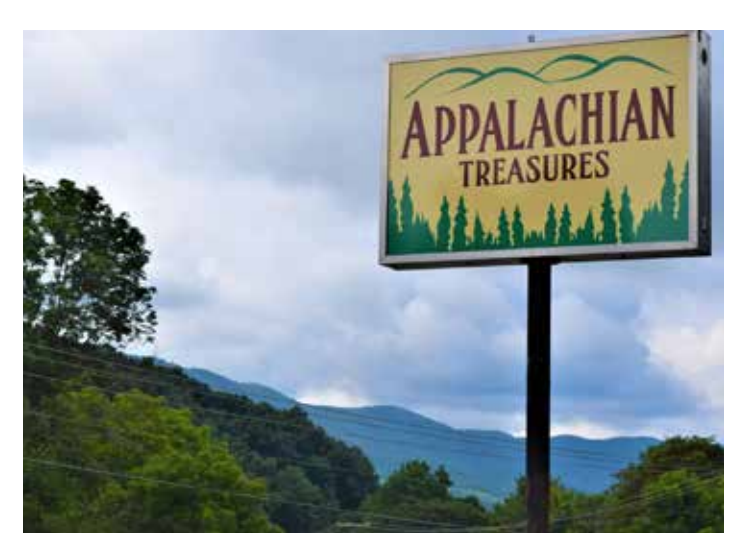
Appalachian Treasures LLC