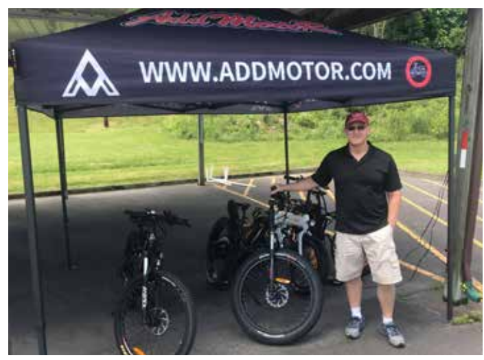
Adventure E-bikes, Inc.