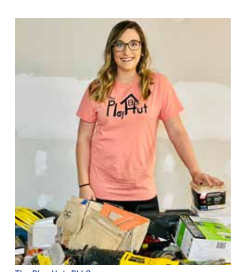
The Play Hut, PLLC