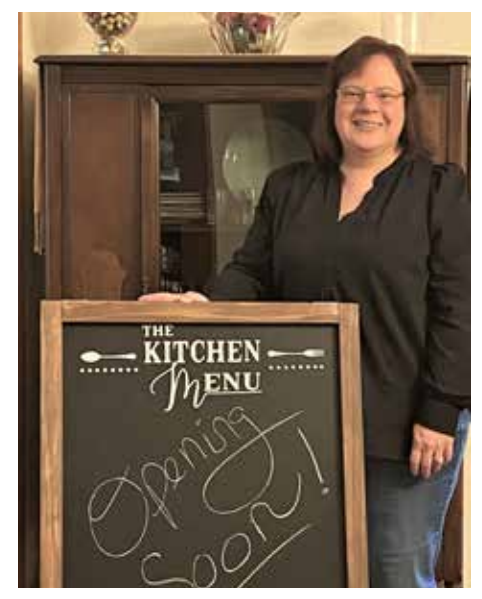
The Marion Kitchen LLC