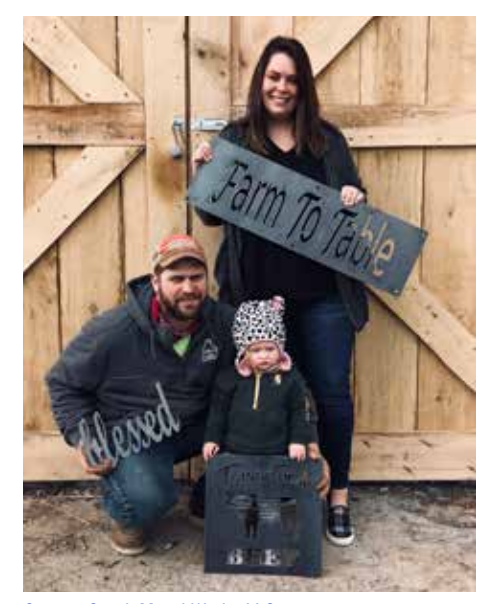
Copper Creek Metal Works LLC