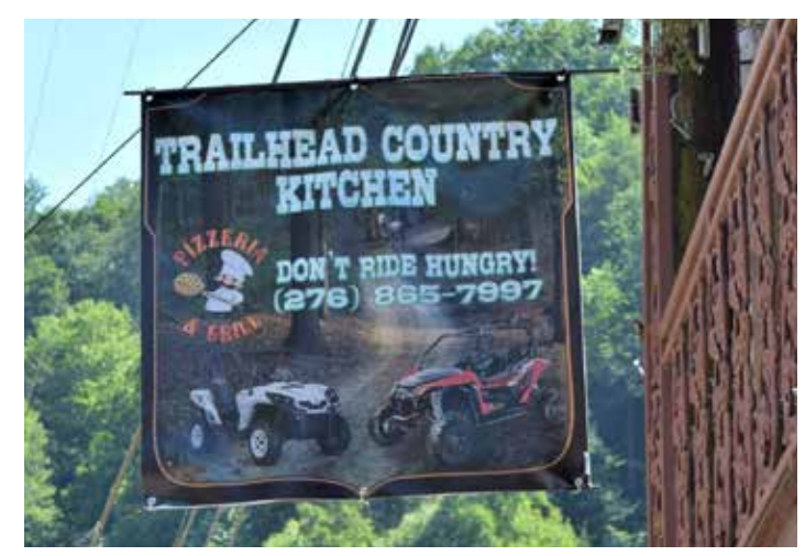
Trailhead Country Kitchen LLC