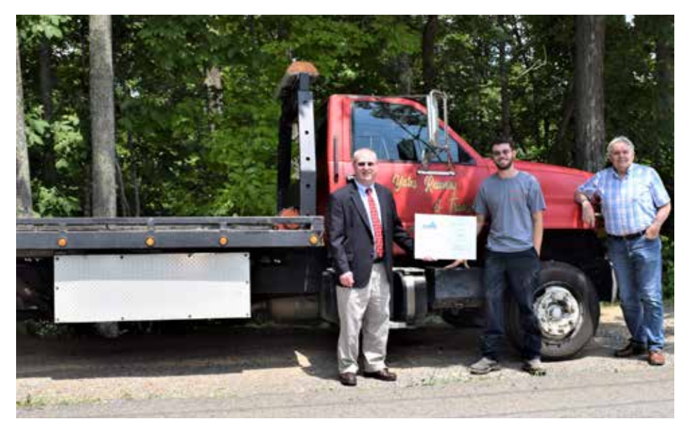
Yates Recovery and Transport, LLC