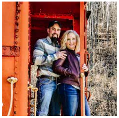
O'Quinn Rentals, LLC