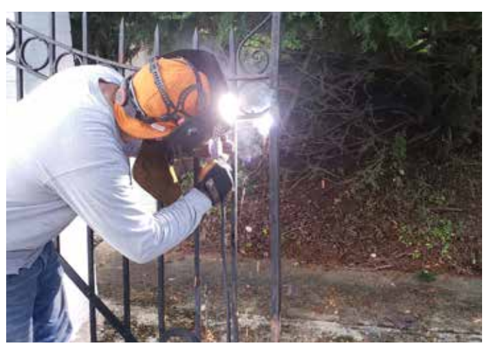
Nxtgen Mobile Welding Services, LLC