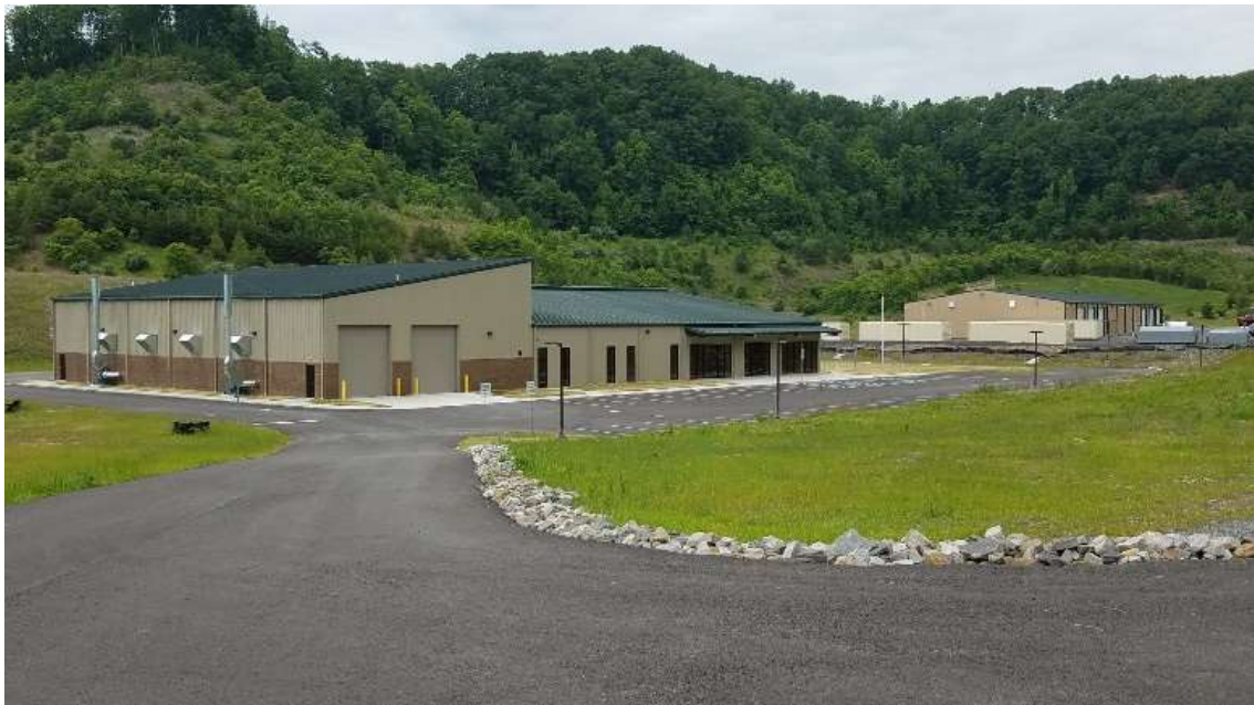
The Southern Gap Transportation and Logistics Center in Buchanan County served as the location of the first meeting of the Virginia Coalfields Expressway Authority on Oct. 6, 2020.