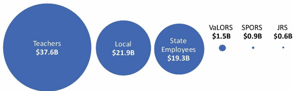
FIGURE 1 VRS pension assets by plan

Investment income is critical to the health of the VRS trust fund, typically accounting for over half of total additions in recent years. However, in FY20 investment income accounted for less than one-third of total additions. More recently, investment income increased significantly, and VRS investments generated a return of 28.3 percent for the one-year period ending March 31, 2021. The total annualized return over the 10-year period ending March 31, 2021 was 8.3 percent, which is well above the 6.75 percent long-term (30+ year) rate of return that VRS assumes for its investments.