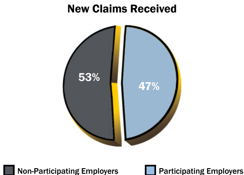
Exhibit 6: Percentage of Claims Received by Employer Type

In FY 2022, VRS received 51 new claims from participating employers and 57 new claims from non-participating employers, for a total of 108 new claims.