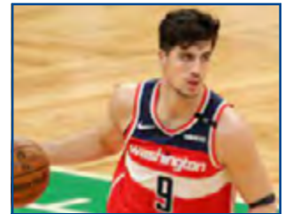
Israeli basketball player Deni Avdija, forward who was a 1st round pick in the NBA Draft started playing for the Washington Wizards in December 2020

Washington Wizards – collaborate with Monumental Sports’ management on events at Capital One Arena involving Israeli basketball player Deni Avdija, the 20 year-old former Maccabee Tel Aviv, forward who was a 1st round pick in the NBA Draft and started playing for the Washington Wizards in December 2020. Deni Avdija's Highlights From His Rookie Season So Far