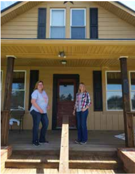
Oma's Haus LLC