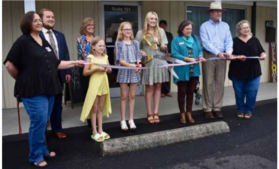
Boutique 276 LLC