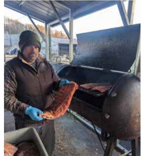
Kane St. Smokehouse LLC