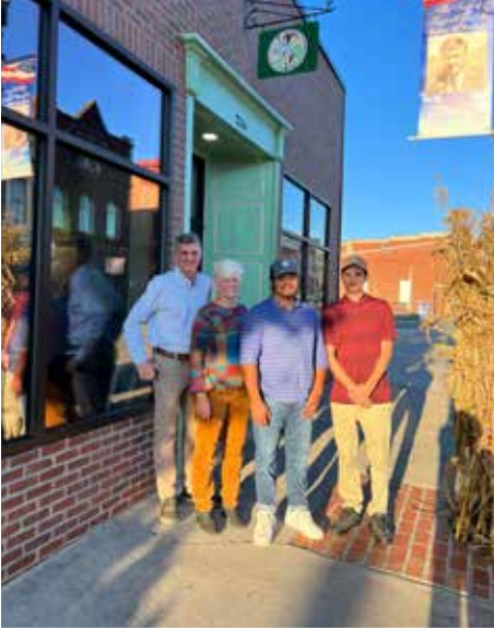
The Happy Goat, LLC