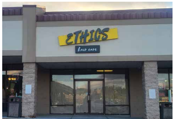
Ethics Hair Care LLC