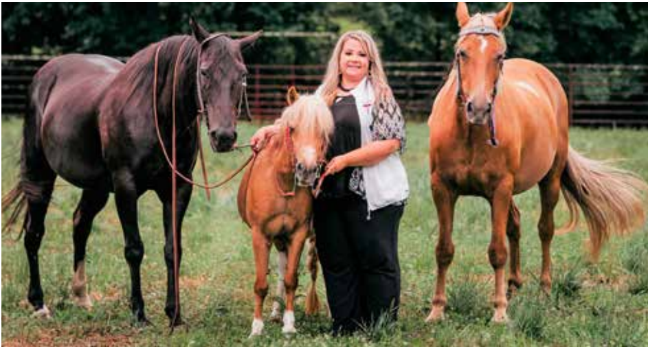
One Step At A Time, LLC