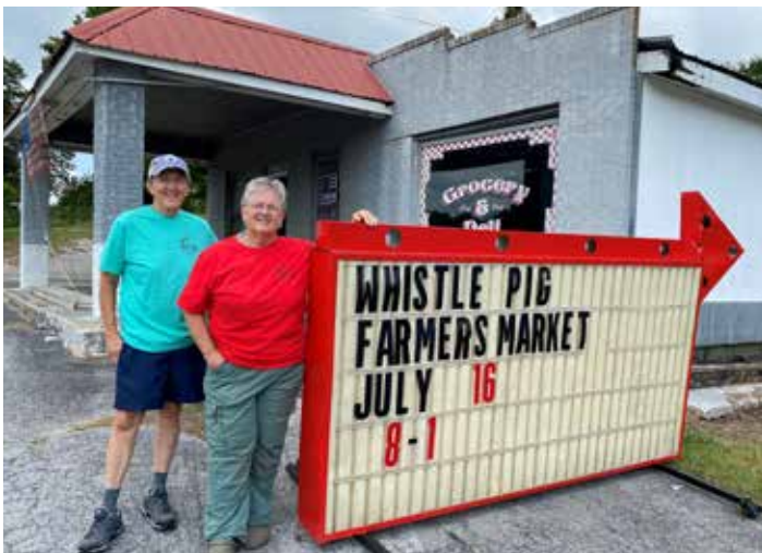
Whistle Pig Country Store, LLC