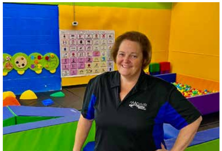
Adair Behavioral Services LLC