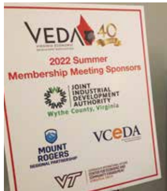
VCEDA was a sponsor of the Virginia Economic Developers Association (VEDA) summer meeting held in Wytheville, VA.