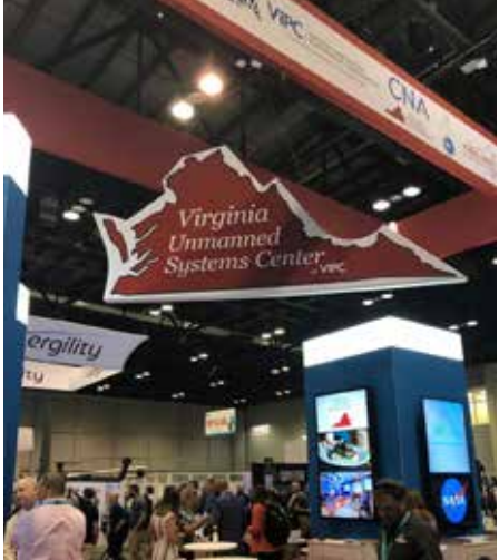
On April 25-28, VCEDA attended and helped sponsor the Virginia Pavilion at the AUVSI Xponential conference in Orlando, FL, to help promote the region to innovation and technology oriented companies.