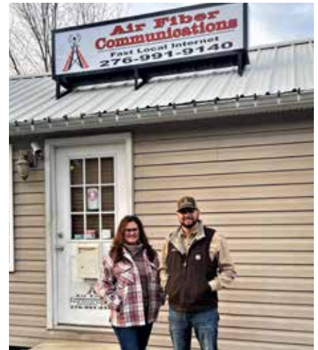
Air Fiber Communications, Inc.