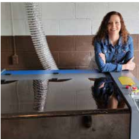
Delightfully Designed, LLC