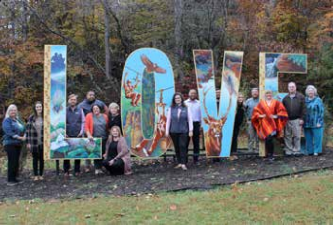
VCEDA hosted a familiarization tour of Southwest Virginia's e-Region for staff members of the Virginia Economic Development Partnership (VEDP) in October. Breaks Interstate Park was one of the stops on the two-day tour of the region.