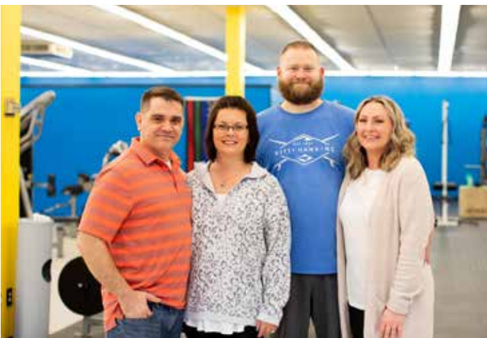
Universal Fitness LLC d/b/a Absolute Fitness