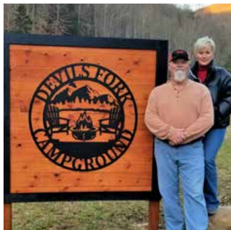
Devil's Fork Campground LLC