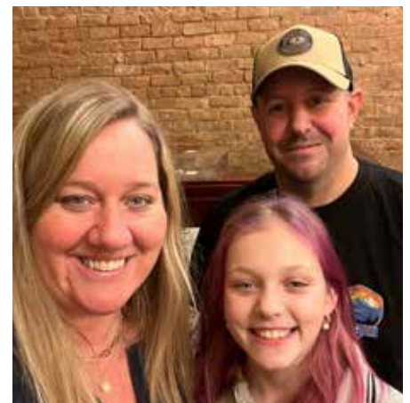
Bee Noodled, LLC