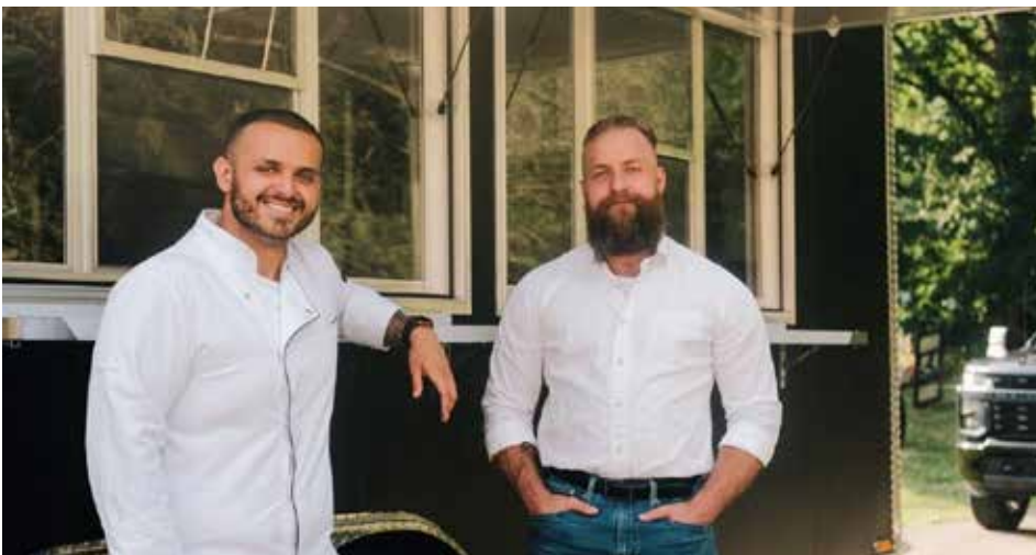
Cluck Truck, LLC