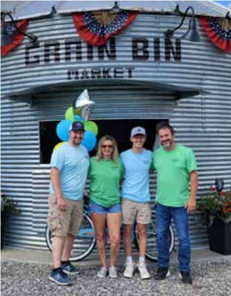
Grain Bin Market LLC