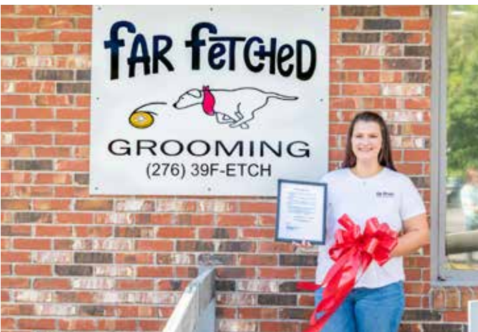
Far Fetched Grooming LLC