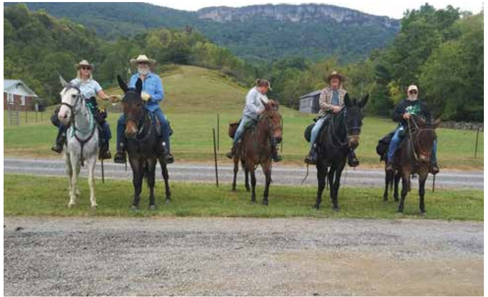
Rock Bottom Horse Camp, LLC