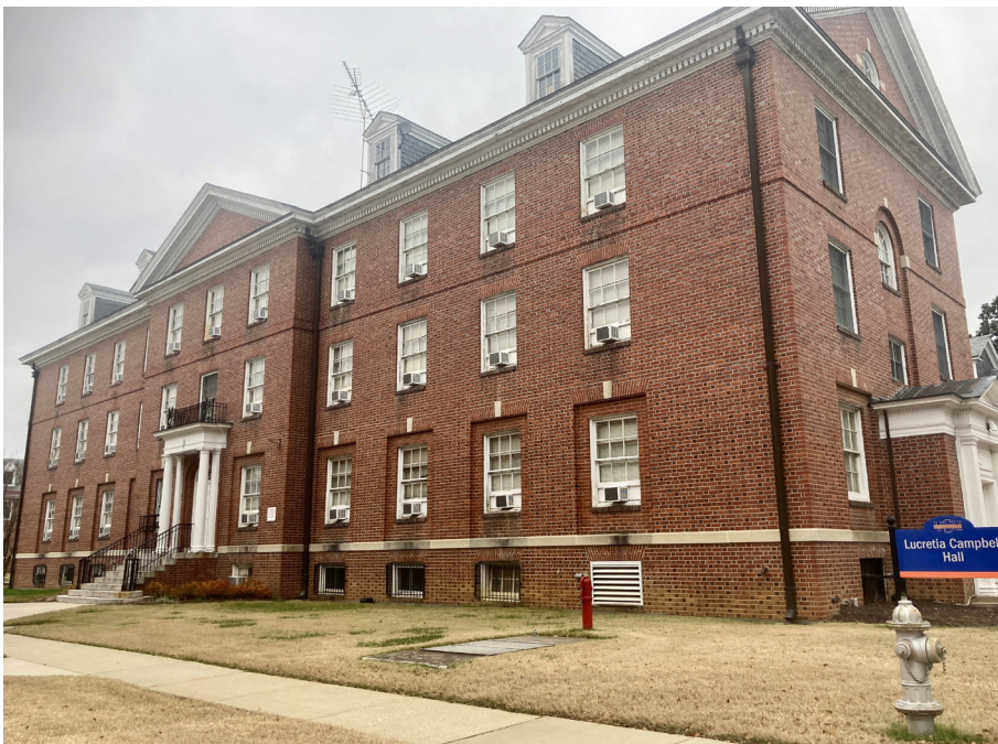
Pictured left: Lucretia Campbell Hall on the VSU campus in 2023.