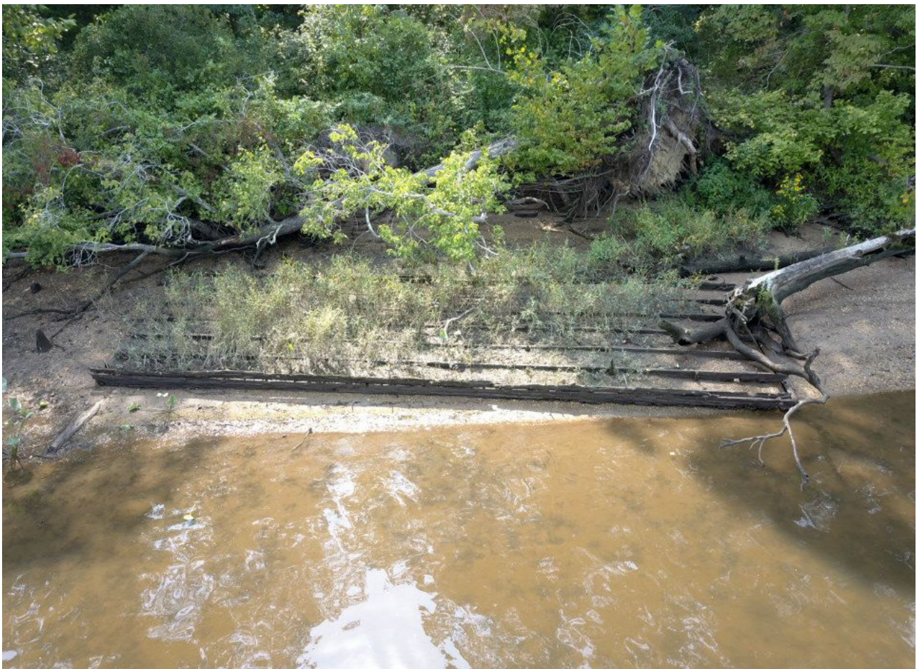
Pictured above: The DeFarge Barge site in 2021.