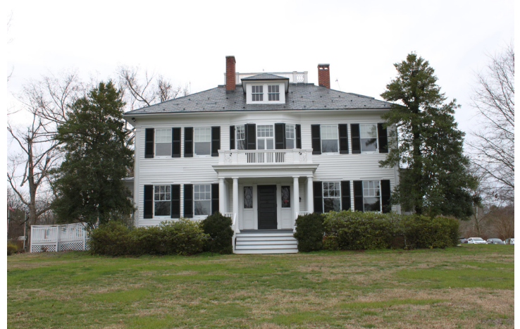
Pictured above: VCCS Rappahannock Community College's Chinn House in 2020.