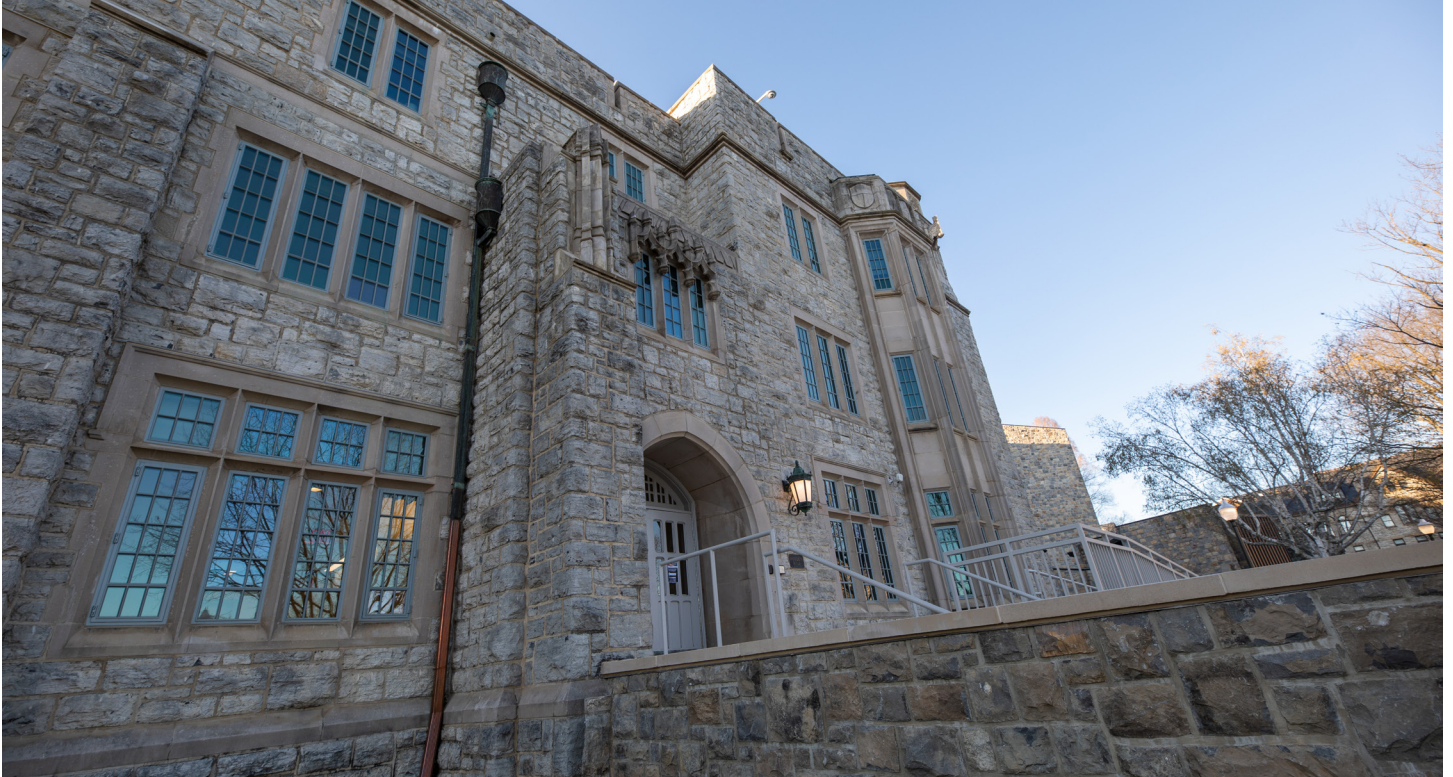
Pictured: (Above) Holden Hall's 1939 south wing faces the Drillfield, the center of campus. It is an excellent example of Carneal, Johnston & Wright's collegiate gothic compositions at Virginia Tech. (Bottom left) A restored precast window surround and replacement steel window. (Bottom right) A small octagonal turret with architectural precast details, providing vertical emphasis to the southeast corner of the building, punctuating the façade and announcing the entry point.