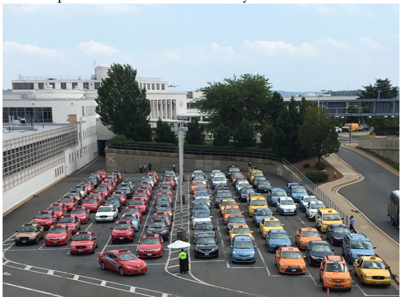
Taxicab Queue at Ronald Reagan Washington National Airport

In 1990, the signatories embraced economic deregulation in the Washington Metropolitan Area by amending the Compact to lower market entry barriers for carriers licensed by the Commission “while maintaining a regional approach to transportation and keeping those controls necessary for the security of the public.” This was accomplished chiefly by eliminating the need for hearings on applications for operating authority while preserving the Commission’s power to prescribe insurance and safety requirements.