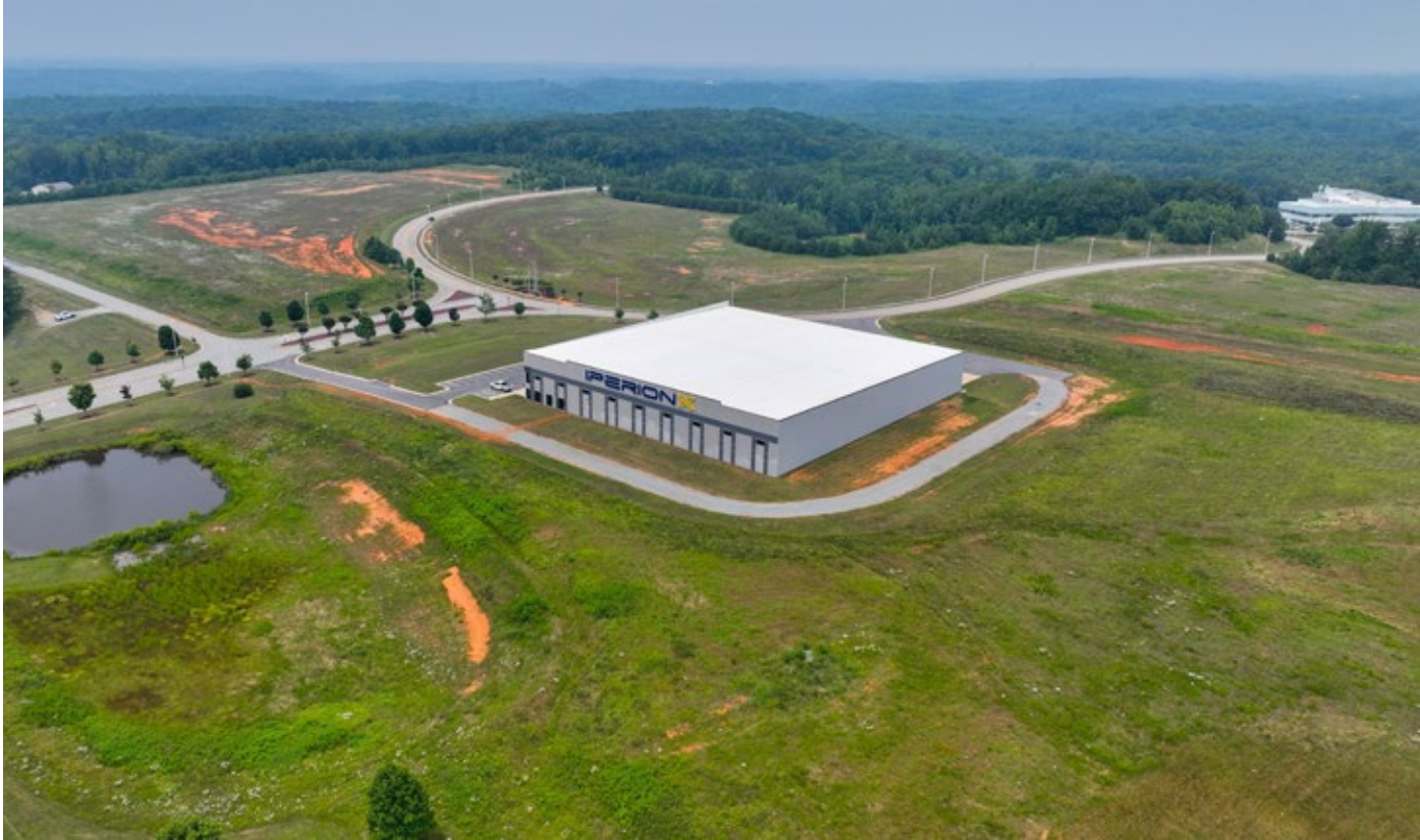
PerionX chose South Boston and Halifax County as the site for their first titanium demonstration facility. The facility will create over 100 new jobs and over $80 million in investment.