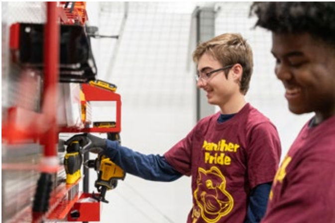
Students work on a project at the Center for Information Technology Excellence (CITE) Lab, operated by Southside Virginia Community College, at the Lake Country Advanced Knowledge Center in South Hill. The CITE Lab trains students for high-demand IT careers.