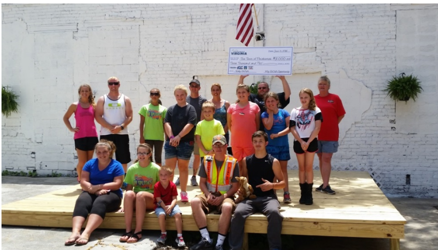
Town of Pocahontas receives a Rally SWVA mini grant.