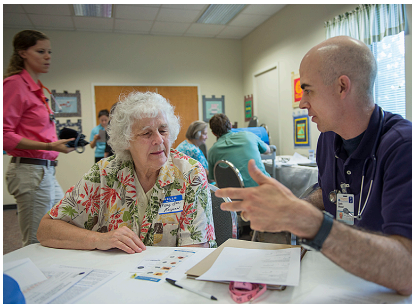
UVa Clinical Nurse Leader students perform cancer screenings near Big Stone Gap, Va.