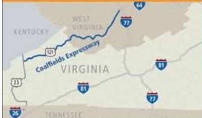
Information on CFX in Virginia Department of Transportation website www.vdot.gov/projects/infrastructure/coalfields_expressway.asp

MORE INFORMATION ON THE PROPOSED VIRGINIA COALFIELDS EXPRESSWAY. USE THE QR CODE.