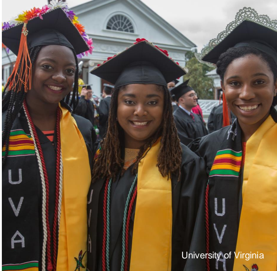
University of Virginia