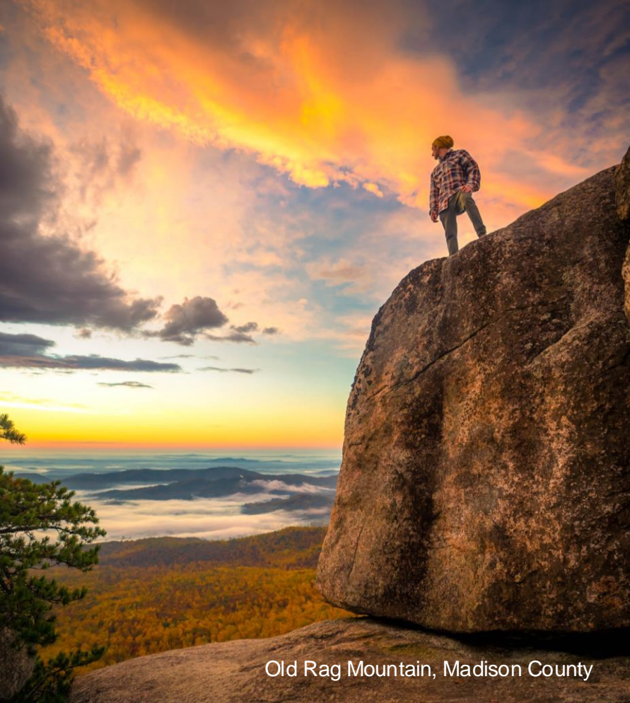
Old Rag Mountain, Madison County