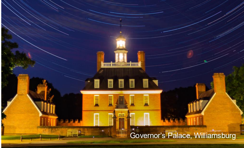
Governor's Palace, Williamsburg