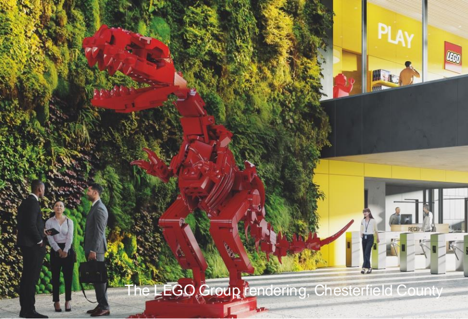
The LEGO Group rendering, Chesterfield County