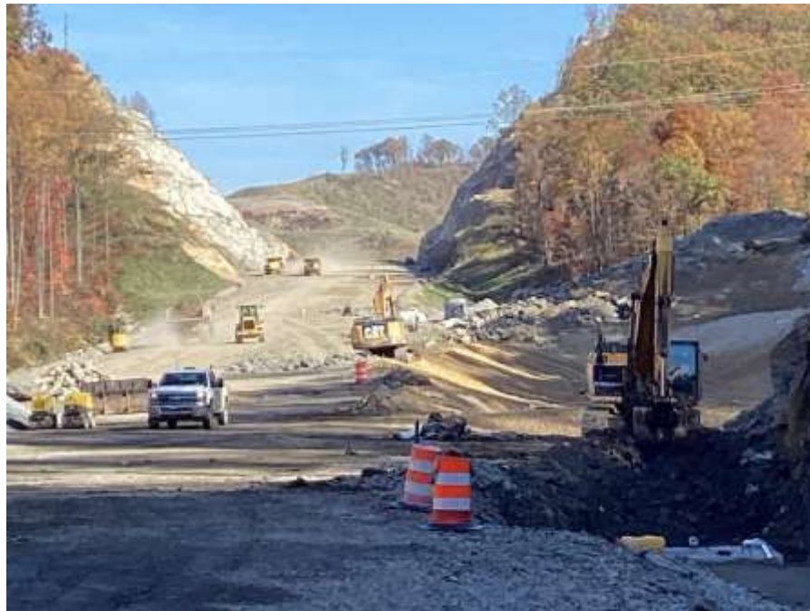
Work progresses on the Poplar Creek Phase A & B sections of the Coalfields Expressway, including the new bridge at Grundy, Virginia (below).