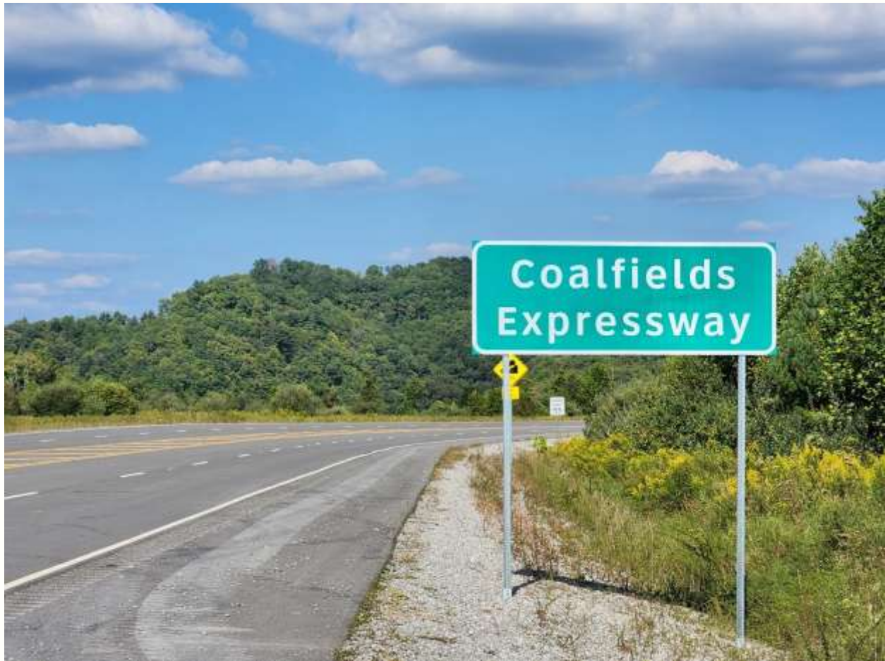
Poplar Creek Phase A was officially dedicated on October 10, 2025. This photo is near the intersection of the Coalfields Expressway and Virginia Route 744 at Southern Gap in Buchanan County, Virginia.