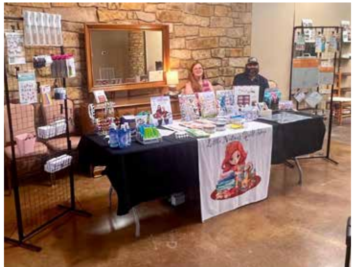
Little Notions Quilt Shop, LLC