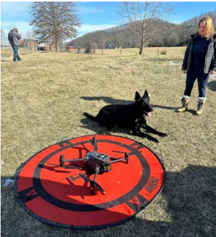
Stay Fly Drone Service, LLC

In 2024, VCEDA approved grants from the Seed Capital Matching Fund to assist 20 new small business start-ups throughout the region. A total of 73 full-time and 80 part-time jobs are projected by those businesses in a five-year period. Since the seed capital program was created in 2017, a total of 204 businesses have been approved, creating 717 full and part-time jobs to date. Jobs projected to be created within five years total 1,508. Total investment by these businesses in a five-year period is projected to be $11.97 million.